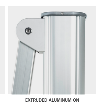
ALL CRITICAL JOINTS

Note: Umbrella clearance dimensions are measured while not mounted in a base. Depending on the selected base, these clearance measurements will change. All dimensions have a +/-5" tolerance based on multiple variables: pin placement height, crank tautness, and fabric weight.