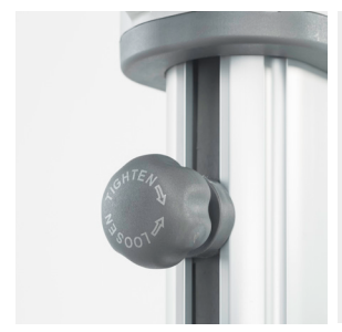
INFINITE TILT SYSTEM