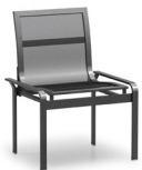
ARMLESS DINING CHAIR M 5635M M 5635M-2 (2 Pack*) H: 34" W: 25" D: 21" Seat Ht: 18" Arm Ht: N/A (Stackable: 2-6)

Our Elevate mesh collection puts a twist on our classic visual designs, while adding features that make it the ideal choice for hospitality, workplace, rooftop, and balcony environments. Crafted with solid aluminum frames for added weight and resistance against strong winds, these pieces have a unique shape that makes both the armed and armless units fully stackable. In addition, this collection is resistant to salt, sun, snow, and anything else nature can throw at it.