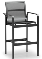
BAR STOOL M 5647M H: 46" W: 25" D: 21" Seat Ht: 30" Arm Ht: 36"