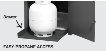
EASY PROPANE ACCESS