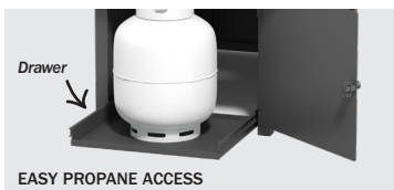
EASY PROPANE ACCESS