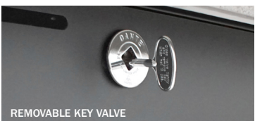
REMOVABLE KEY VALVE

Every Homecrest fire table features easy propane access, a removable key valve for flame control, and a standard burner riser to keep the table surface cool. We also offer glass guards, which are recommended for use in windy conditions to contain the flame.